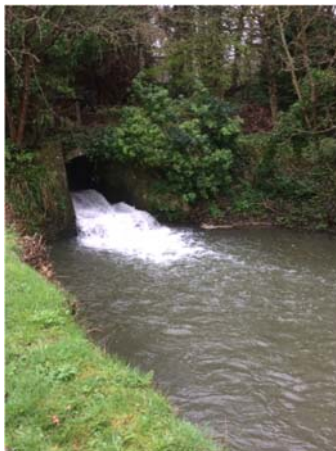
Cuckmere River at Hellingly Water Mill