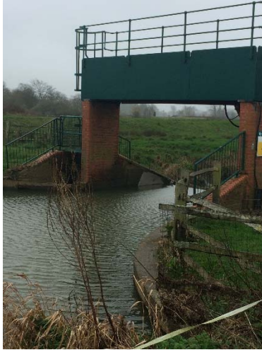
Milton Lock – Freshwater side