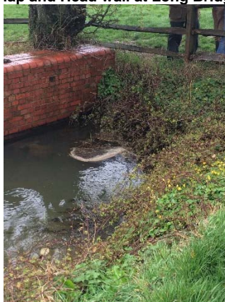
Flap and Head wall at Long Bridge

The party were taken to the mouth of the Cuckmere (the Cut) and were shown the problems created by marine shingle deposition blocking the river mouth. A discussion was had around the issues and extent of upstream flooding caused by the phenomenon of shingle build up, the regularity of maintenance and the receptor site for the deposition of the shingle.