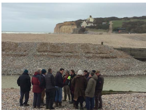
Shingle deposition area on west side of river – receptor site for maintenance