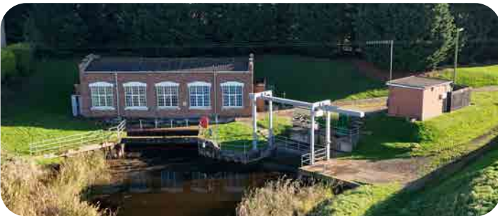
Aerial Image of the Crabbs Abbey Pumping Station.

The new motor control systems were installed before Christmas 2025, however further progress at this site has been delayed due to the challenging winter weather conditions and the inability to safely overpump drainage network flows across the road (Stow Road, north of Stow Bridge) during prolonged wet periods.