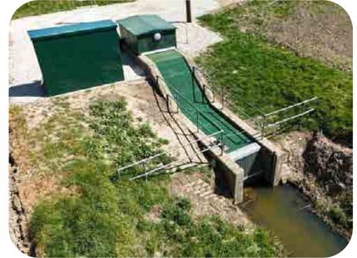
New Archimedes Screw being lifted into position in November 2025 Aerial Image of the upgraded Waltham Farm Pumping Station.